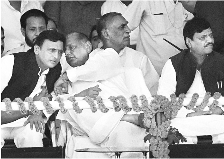
(From left): Uttar Pradesh Chief Minister Akhilesh Yadav with Samajwadi Party supremo Mulayam Singh Yadav and party state president Shivpal Yadav at a programme to flag off the Vikas Rath Yatra in Lucknow on Thursday

Addressing the huge turnout of SP workers at the La Martiniere College Ground here, Akhilesh claimed his government had fulfilled all the promises made in the party manifesto and ushered in balanced development encompassing the rural and urban areas.